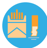
cigarettes & butts