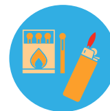
lighters & matches

Matches, lighters, lit cigarettes and faulty vaping devices can cause serious burns, injuries and house fires .